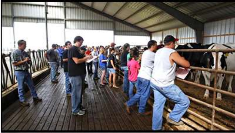
Students visit Stateland Dairy as part of their academic classwork.

Students still work hands-on with cows daily, but now have an additional set of tools to monitor herd health, assess and adjust nutritional requirements, track milk quality and production, learn and implement recent management advancements, and spend more time with the herd to identify individual cow needs. This experiential learning provides our students with a solid foundation in dairy technology and management, preparing them for a career in an ever-adapting industry. "Stateland Dairy has provided me with countless memories and hands-on learning opportunities. I have been able