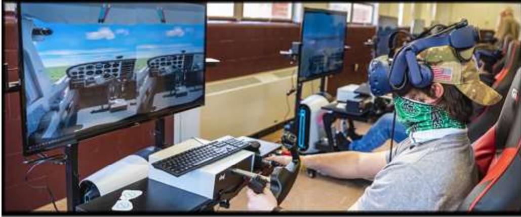
Students using 2D/Virtual Reality professional flight simulator.

Along with the aircraft and airport resources, the program also boasts three flight simulator laboratories located in the Whalin Complex. The Alsim 200MC and the Professional Flight Controls (PFC) DCM-MAX flight simulators can