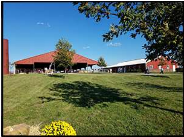
Stateland Dairy at Meadowbrook Farm.

Eastern Kentucky University's (EKU) Meadowbrook Farm, located just a 15-minute drive from the Richmond campus, provides a unique hands-on learning environment and teaching laboratory for the Department of Agriculture and also provides outreach to the community. This 720-acre facility boasts state of the art beef, dairy, sheep, swine, and crop production units.