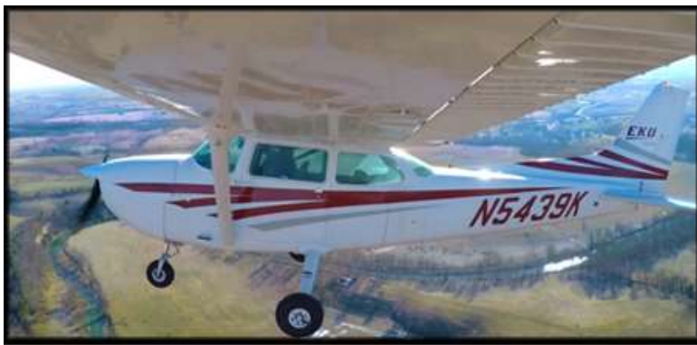
Student logging flight hours.

Eastern Kentucky University's (EKU) Bachelor of Science degree in Aviation is the only program of its kind in Kentucky. The Aviation program was started in 1983 and has evolved into one of the best programs in the country. The B.S. degree in Aviation provides three concentrations to meet the needs of the aviation industry: Professional Flight, Aerospace Management, and Aerospace Technology.