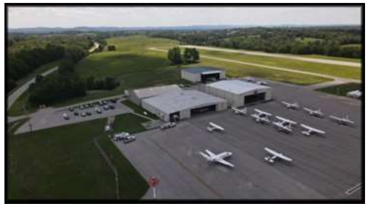
Central Kentucky Regional Airport, home of EKU’s Aviation Program.