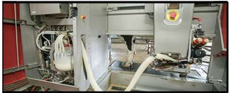
Robotic milking technology at Stateland Dairy.